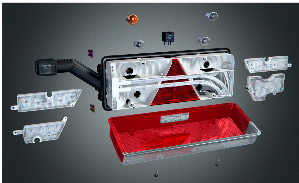
Exploded drawing of Europoint III Explosionsbild